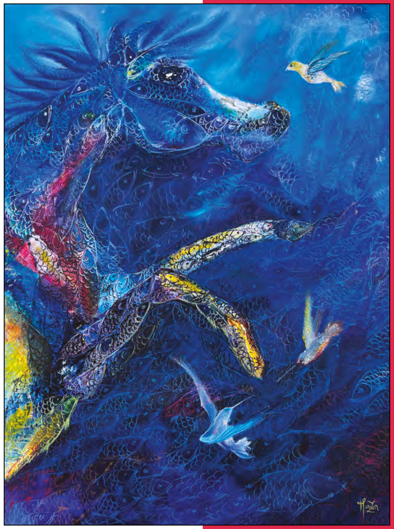
Dancing in the blue sky, Oil Painting, 76 x 101cm