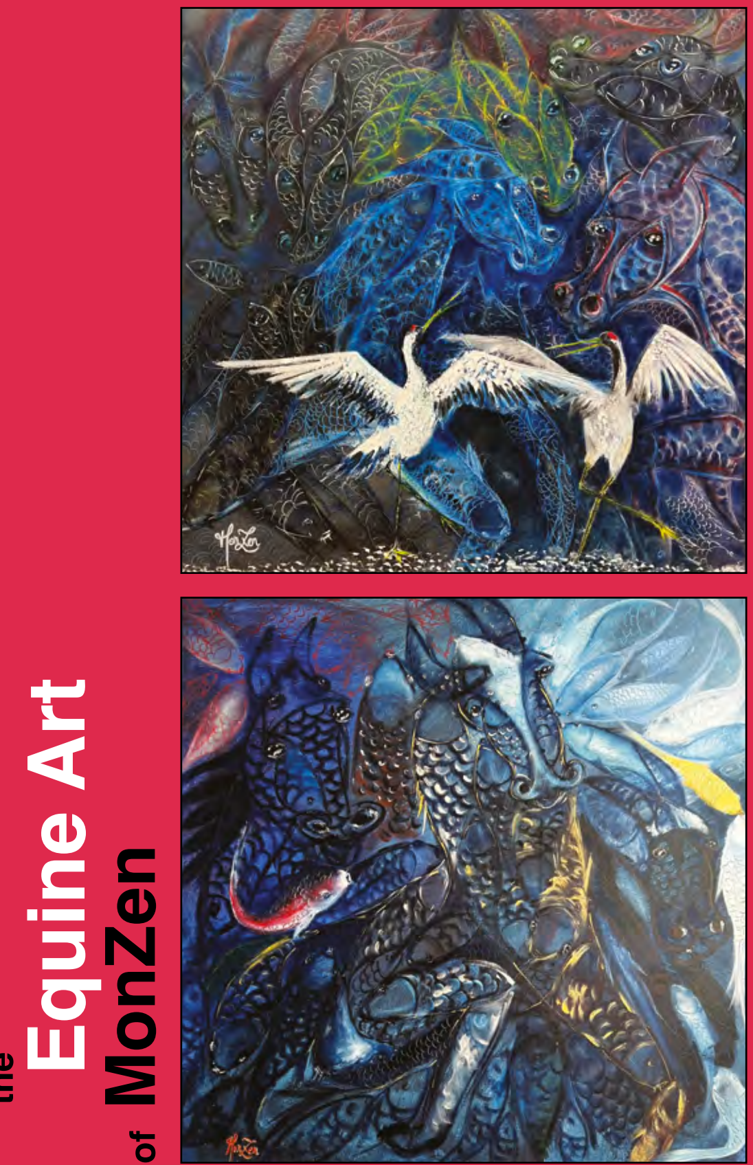
Galloping into the blues, Oil Painting, 90 x 90cm