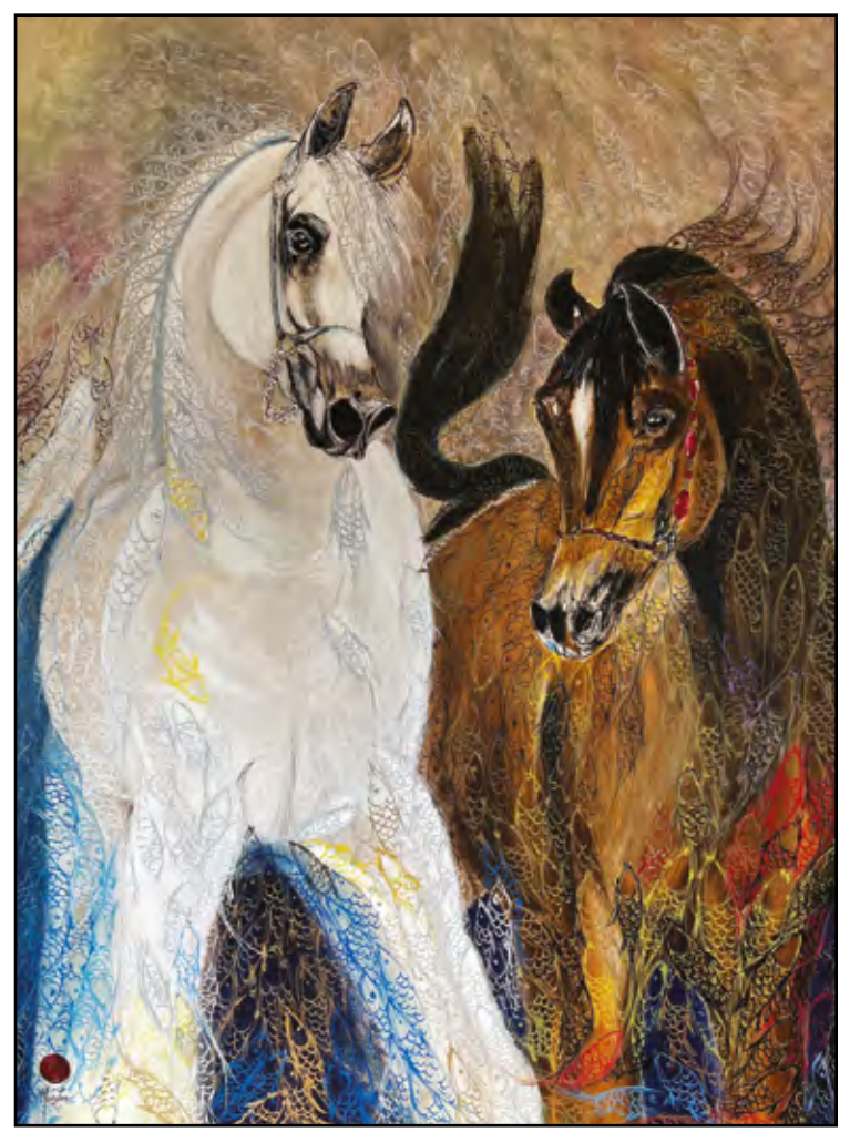
Two Stallions, Oil Painting, 91 x122cm