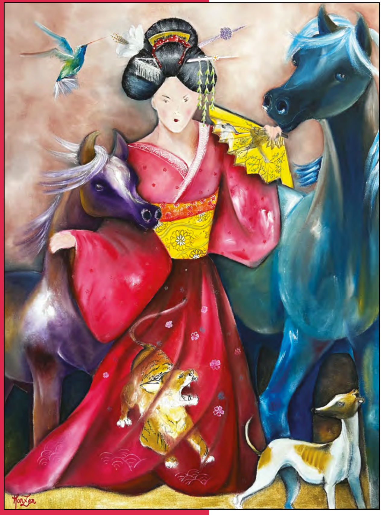
Giulia, Oil Painting, 76 x 101cm