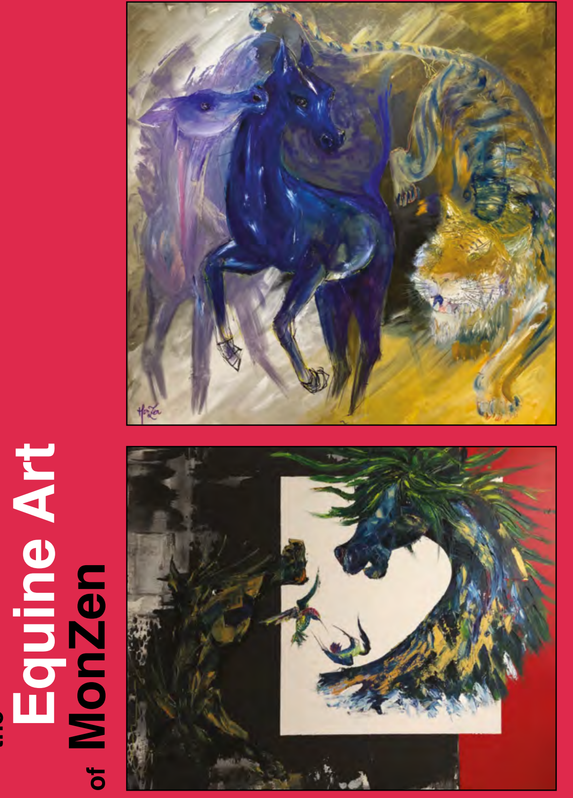
In the wild, Oil Painting, 100 x 100cm