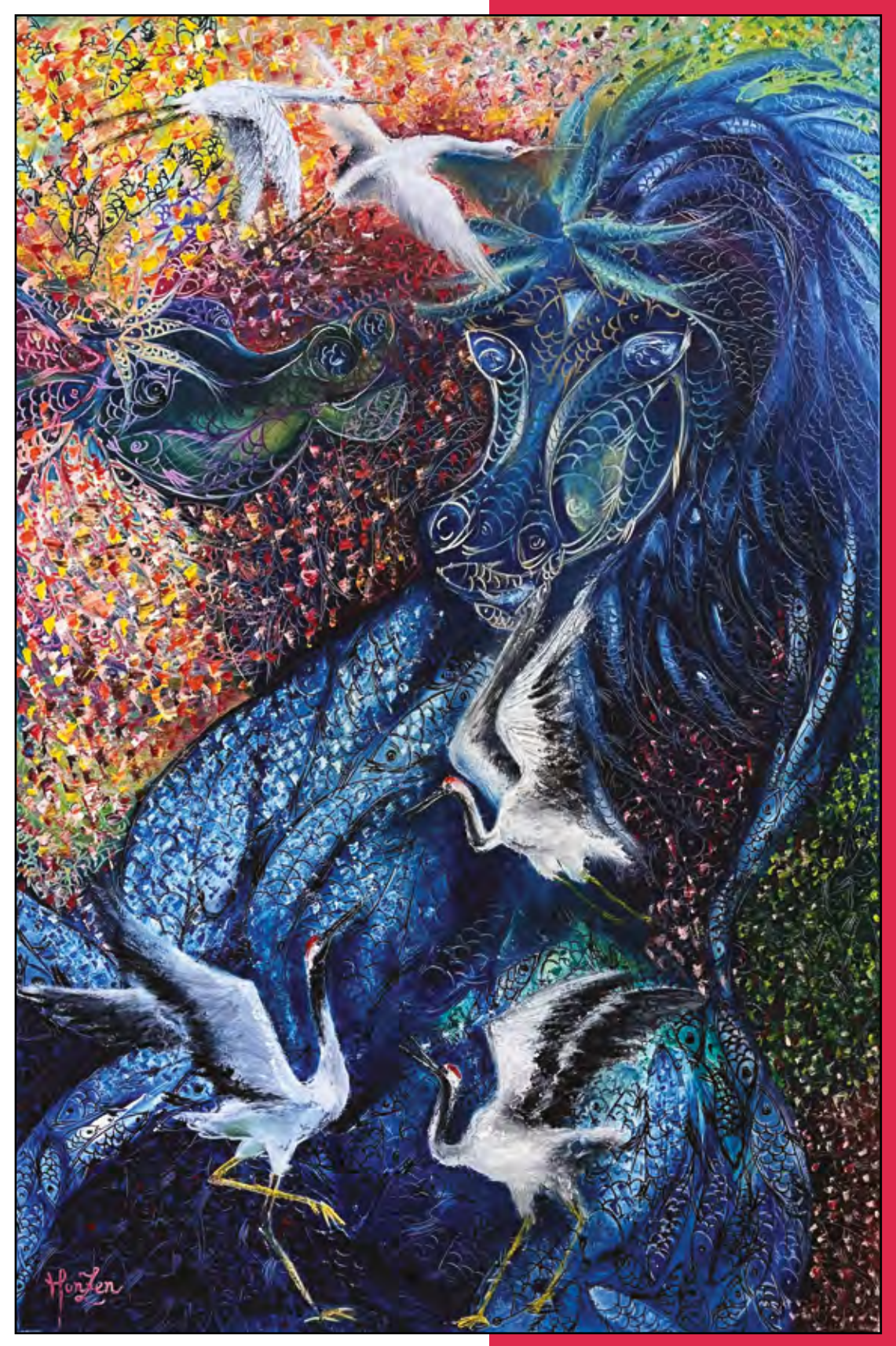
The Mask, Oil Painting, 61 x 91cm