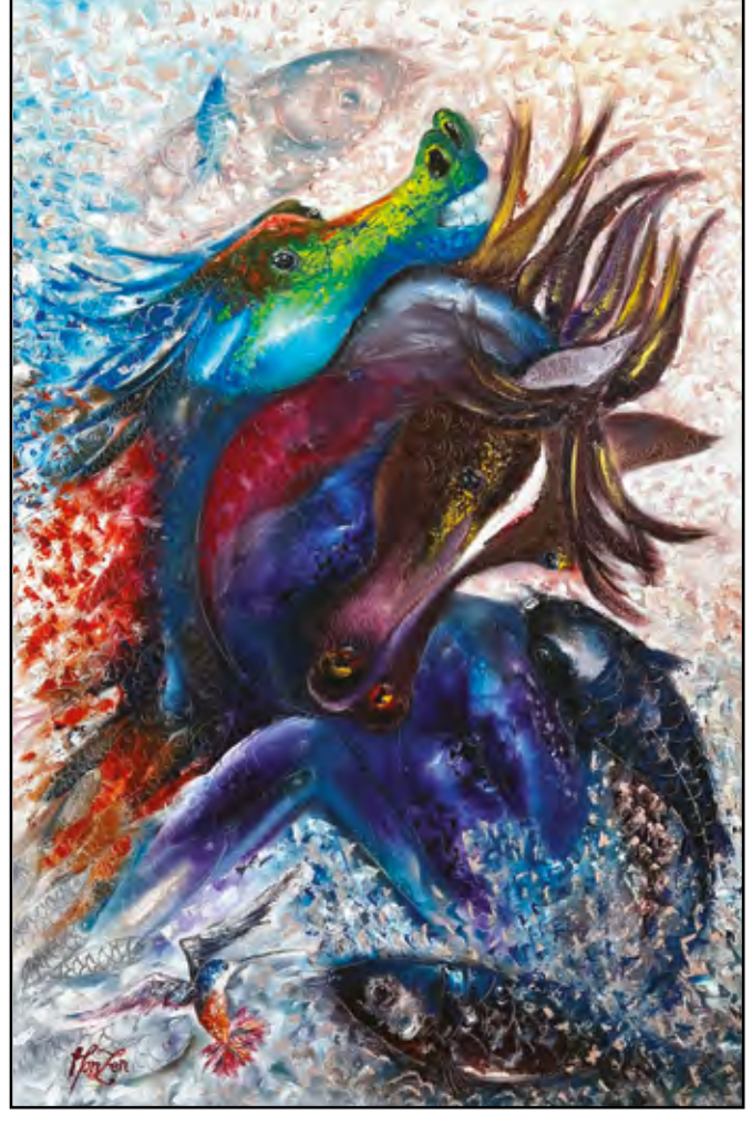
Serenity, Oil Painting, 61 x 91cm